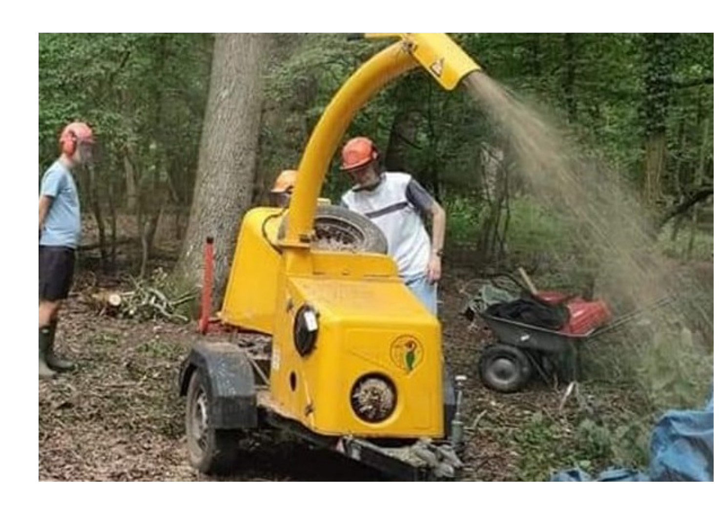
At the time of writing this report a theft of a wood chipper from POULTON WOOD NATURE RESERVE ALDINGTON Saturday 26^{th} November Crime number 46/229751/22