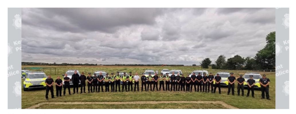
Rural Task Force officers

A new approach is being taken by officers across the East of England in an effort to combat hare coursing.